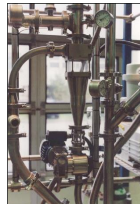
Simoloyer® CM01-2lm-s1-SK01 (detail view of secondary circuit)