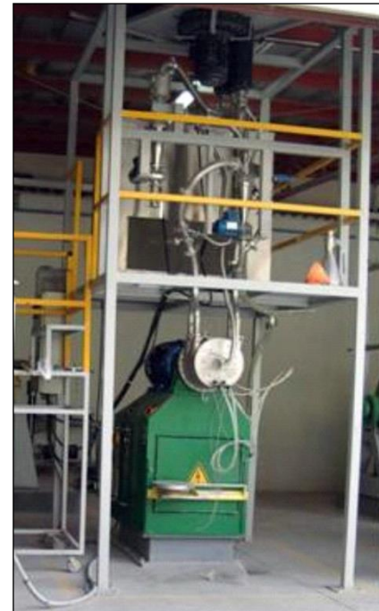
Simoloyer® CM20-20lm-s1-SK20 (single circuit)