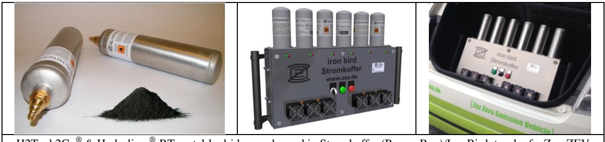
H2Tank2Go<sup>®</sup> & Hydrolium<sup>®</sup>-RT-metal-hydride powder and in Stromkoffer (Power-Box)/IronBird, trunk of a Zoz-ZEV

Compared e. g. to the RT-hydride based H2Tank2Go<sup>®</sup> [10] from Zoz, that at a length of 30cm, a weight of about 4kg at room temperature and at an operating pressure <10bar with a test pressure of 80bar and for just a fraction of the cost, can store more hydrogen, the result seems to be sobering. But it is not ! Zoz to this: "We are here almost at the very beginning of a technology that for stationary and mobile energy storage does offer far higher potentials than room-temperature hydrides, H2-pressure gas systems or electrochemical energy storage / battery - as for today's knowledge - could ever do".