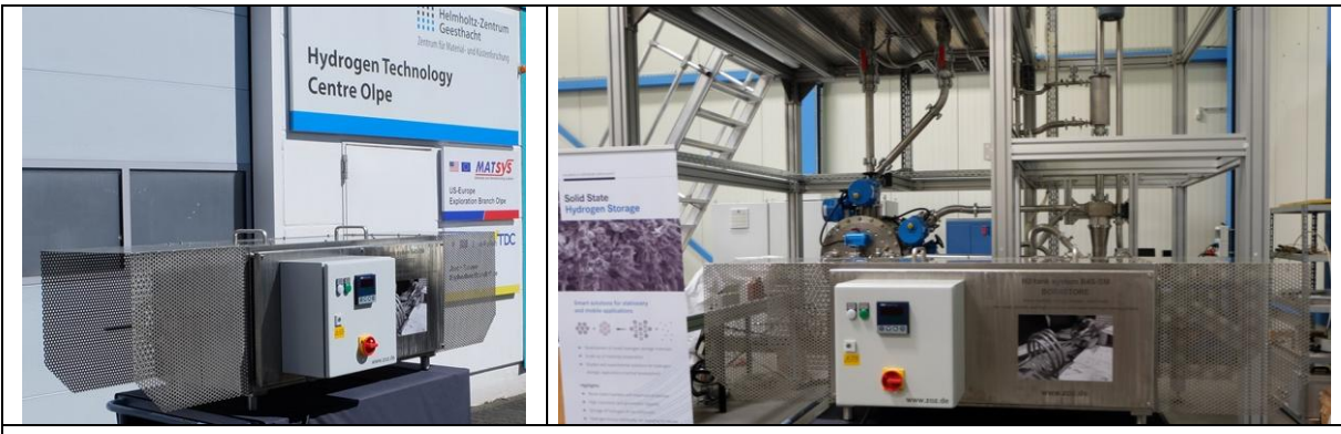
H2-tank system B4S-SM at ZTC in Olpe and inside at the Helmholtz HZG - Hydrogen Technology Centre in front of the Zoz-Simoloyer<sup>®</sup> CM100-s2, a processing unit for the manufacturing of complex metal hydrides

At that time, the control module and interface for the resistance heating system, that is needed for the first tank test operations, was still missing. Meanwhile completed for this at the Zoz headquarters at Wenden (HQH), the tank on last Monday was delivered to HZG that not accidentally entertains the "HZG - Hydrogen Technology Centre, Olpe" inside the Zoz Technology Center (ZTC) at Olpe/Germany. However the charging/loading and further investigation/testing will not be done at Olpe but in Geesthacht. On long term it is planned to provide the temperature of the tank with the waste heat of a high temperature fuel cell (SOFC). At present, a corresponding device is concept at HZG.