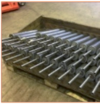
HIP-cans making & decapsulation