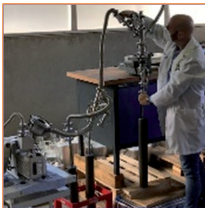
HIP-cans loading HIP-cans closing