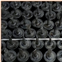
Zoz-HIP Service all inert/vacuum