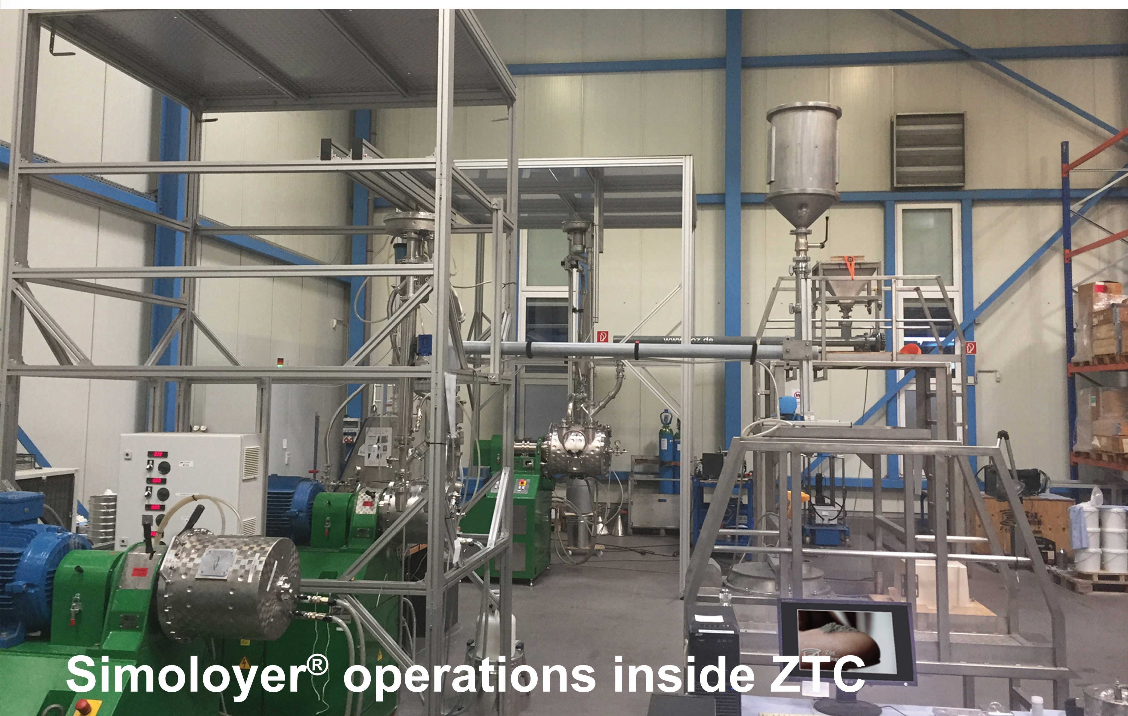
Simoloyer® operations inside ZIC

Large - Scale Manufacturing Demonstration Facility Olpe