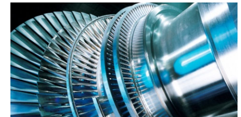
Steam turbine