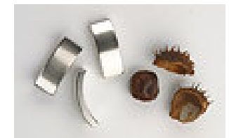
Fly wheel, source: Stornetic GmbH Sintered magnets, source: BEC GmbH