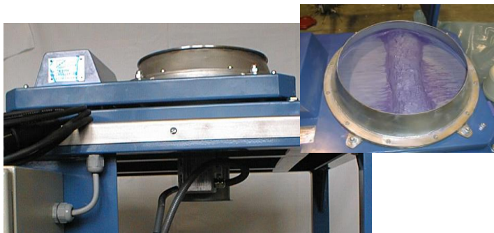
Combi-screen-cart KSW 28 - 600