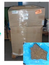
arrival of raw material