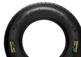
low-emission / high performance tires