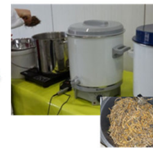
cooking and washing (removing sugar-derivative)