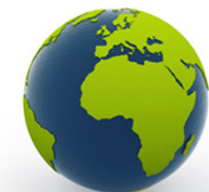
saving the environment for a green world