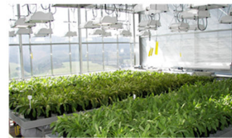
growing and harvesting the dandelion