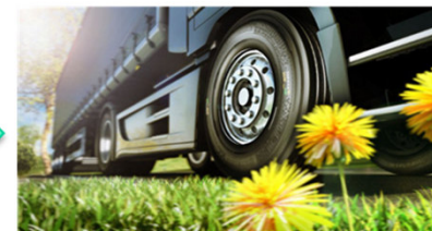
customer delivery / driving with less emissions